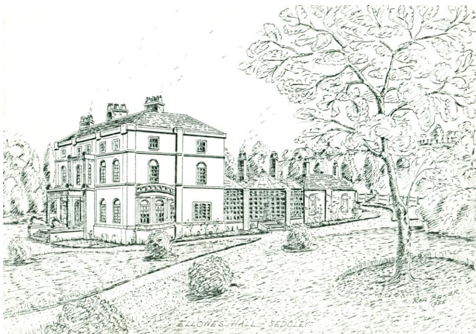
Ellowes Hall 1955