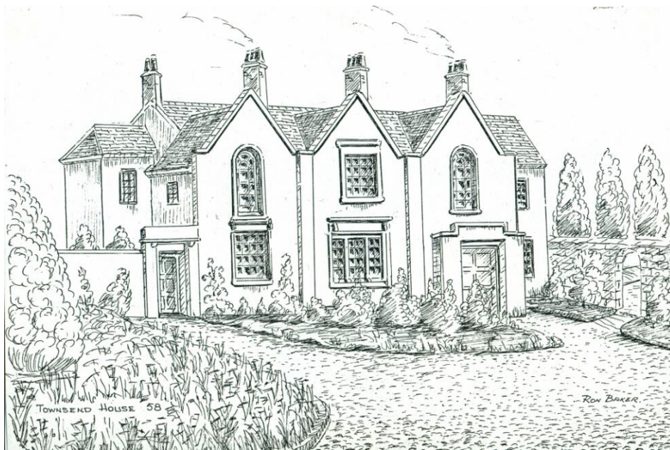
Townsend House 1958