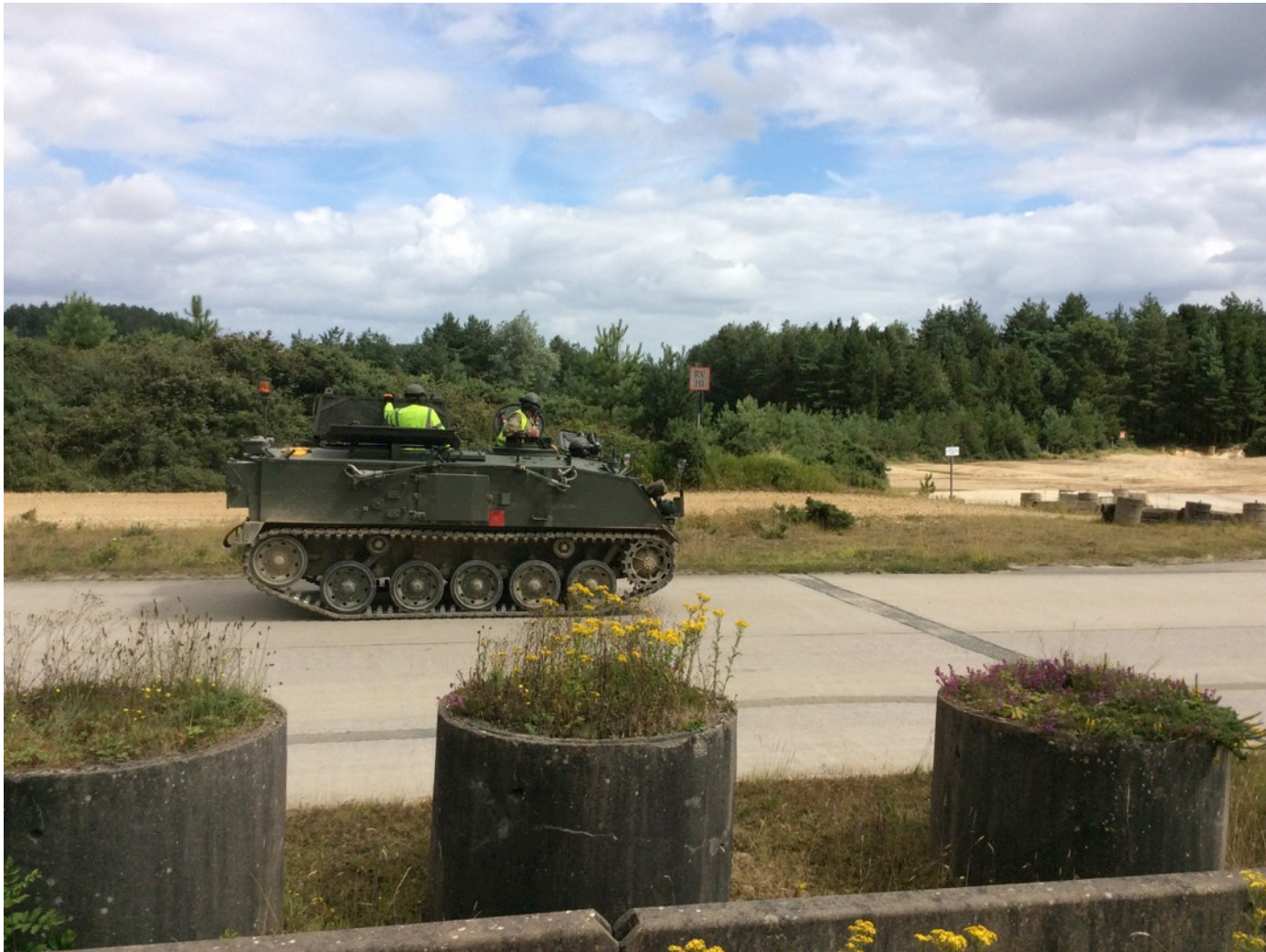
The tank museum at Bovington, Dorset. The collection traces the history of the tank.