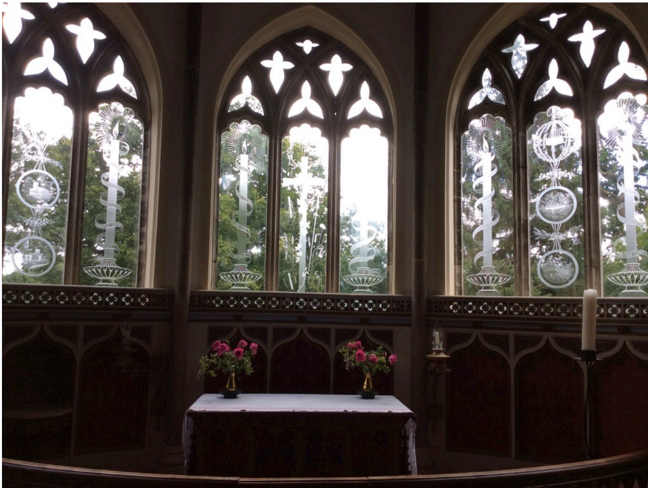
Windows etched by Laurence Whistler at St Nicholas, Dorset.