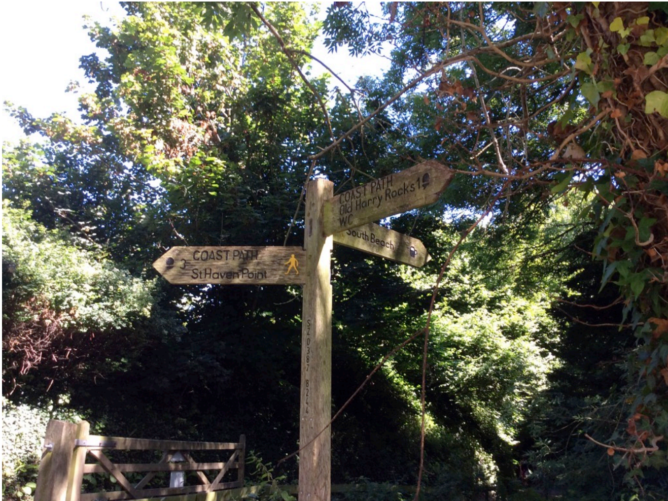
A signpost indicating the Coast Path at Studland.