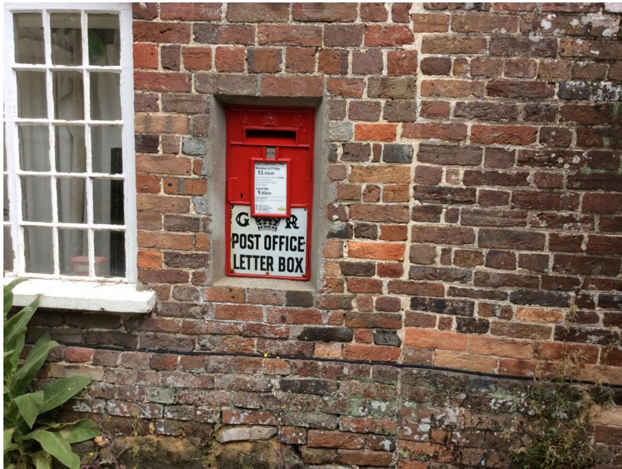
An old letter box set into the wall in the village of Moreton, with the insignia of George VI.