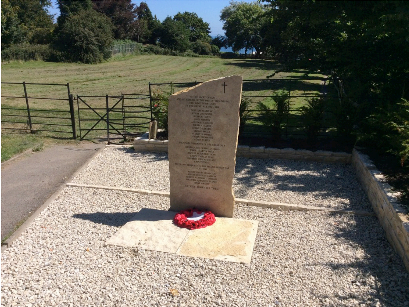
A memorial to those killed in the First War at St Nicholas, Studland.