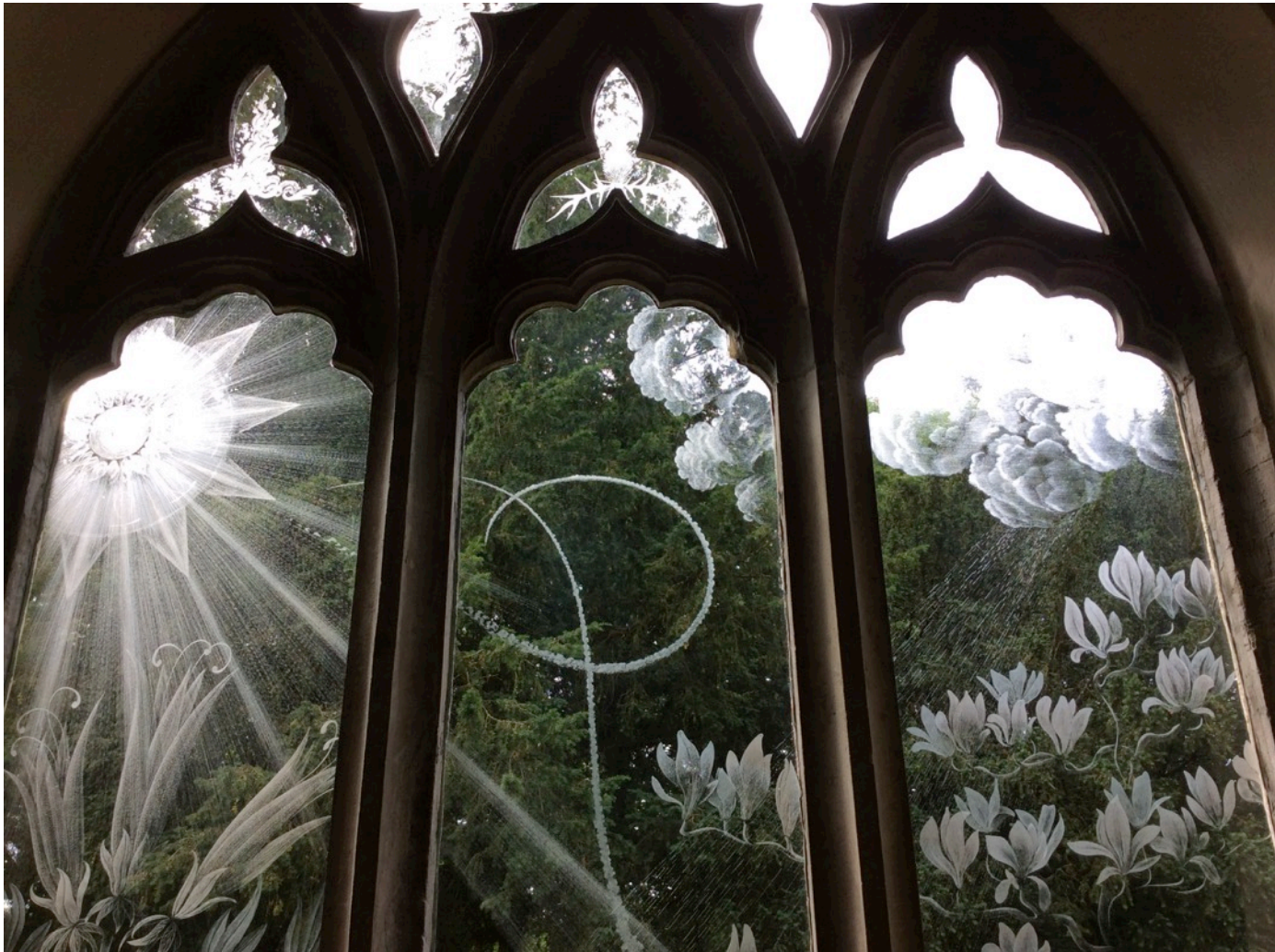
A close-up of three etched window panels by Laurence Whistler at St Nicholas, Moreton.