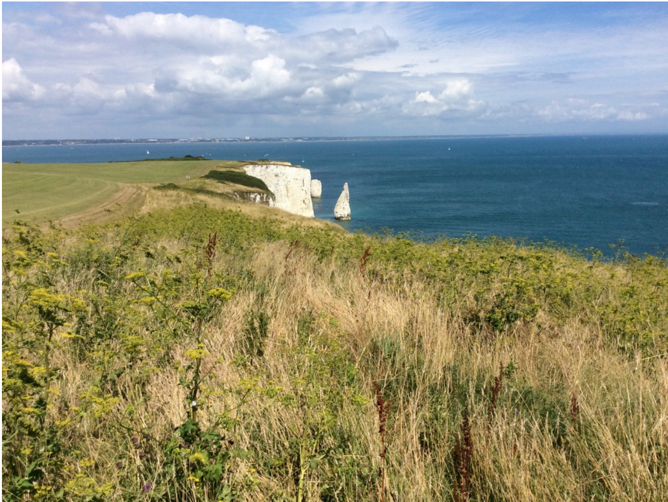
A view of Old Harry Rocks - three chalk formations, including a stack and a stump, located at Handfast Point, on the Isle of Purbeck in Dorset. The rocks can be viewed from the Dorset section of the South West Coast Path.