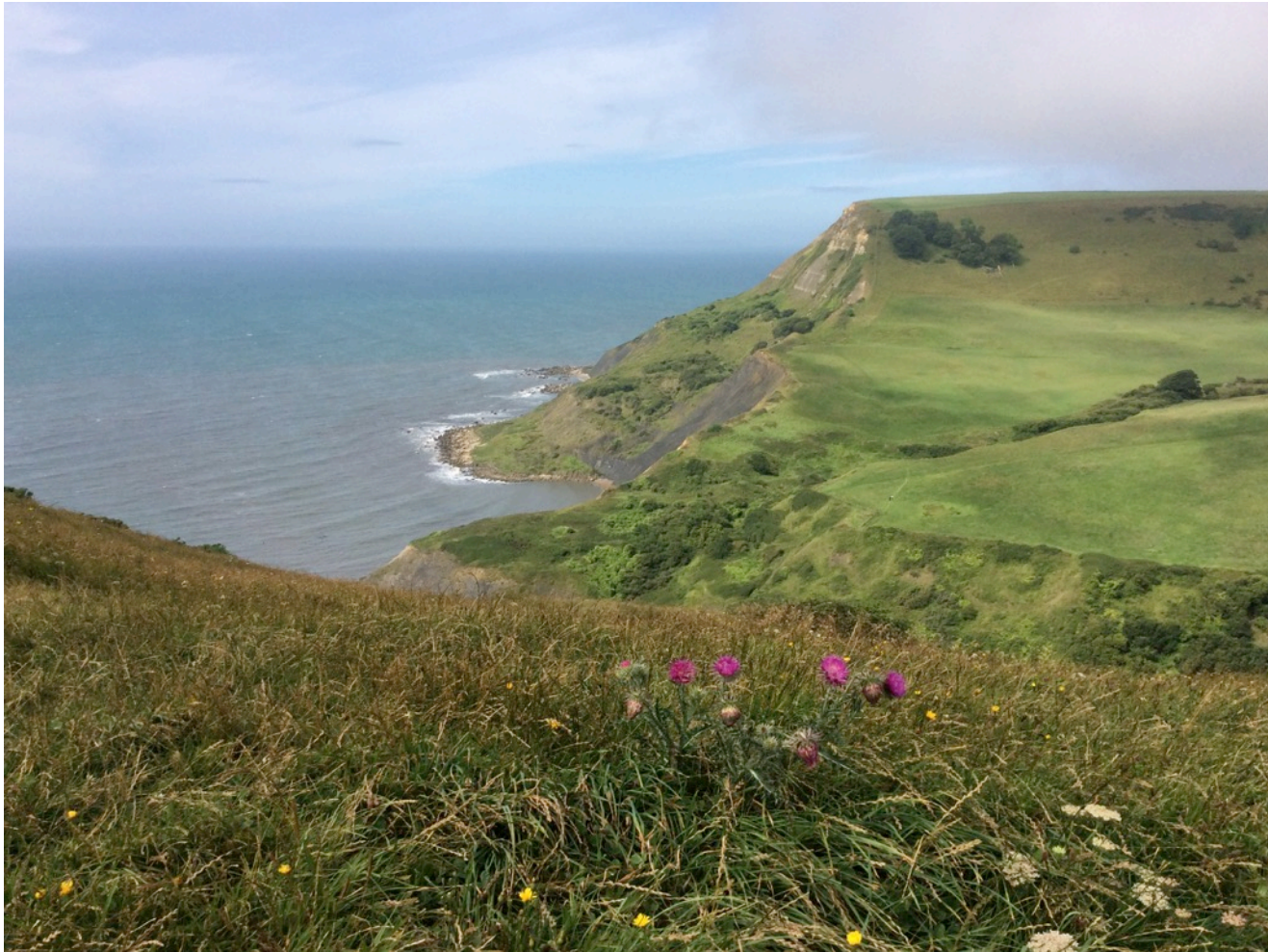
A view from the Marines Memorial near Worth Matravers.