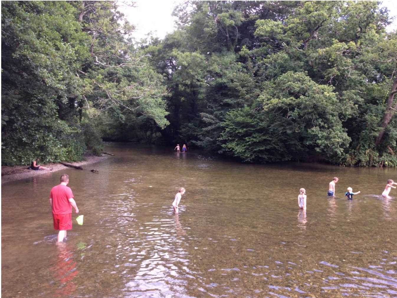
Children bathing in the River Frome at Moreton.