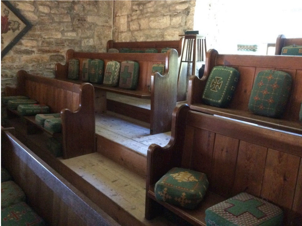
Wooden benches in the Gallery at St Nicholas Studland – All Saints' would probably have looked like this at one time.