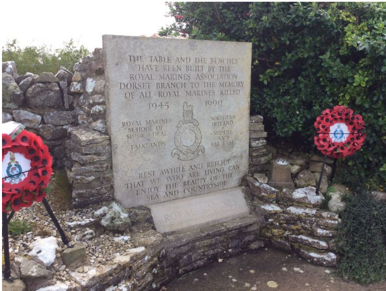
A memorial to Royal Marines killed between 1945 – 1990 near Worth Matravers.