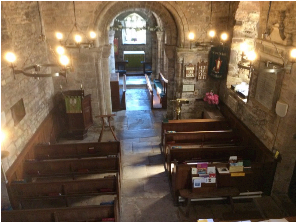
The nave and chancel at St Nicholas, Studland.

The church is about a mile from Old Harry Rocks and there is a view of the very beautiful Studland peninsula.