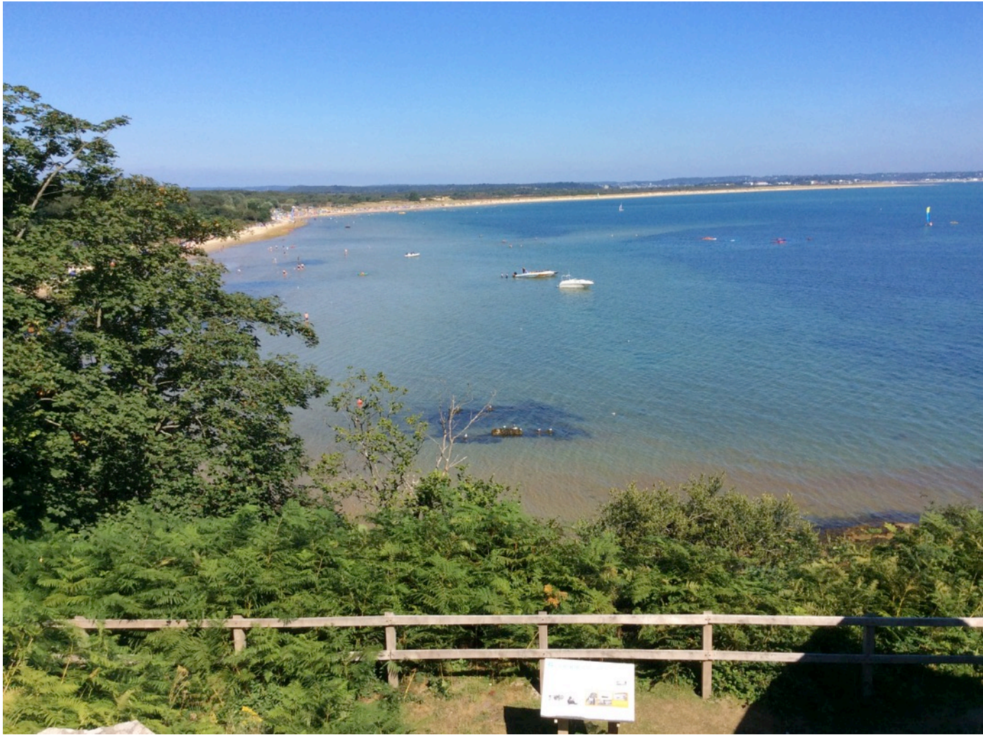
The idyllic Studland peninsula.