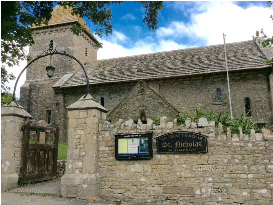
The Parish Church of St Nicholas, Worth Matravers.

The church of St Nicholas, Worth Matravers in Dorset, is in a tiny village very near the South West coast path. There is a memorial to the Royal Marines on the South West Coast Path about 2 miles from Worth, and views from that memorial.