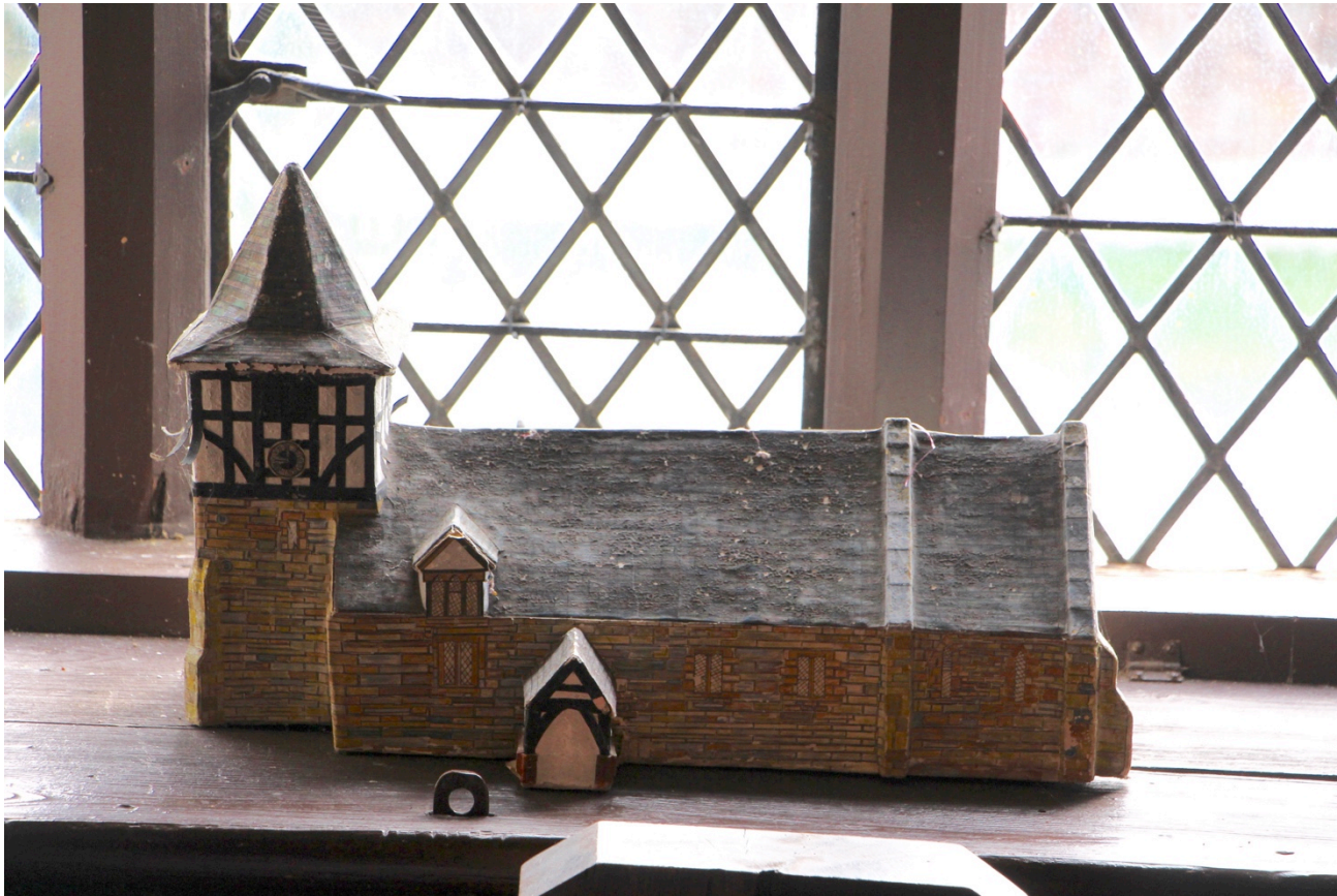
A beautiful model of St James, Defford is on view in a south window.