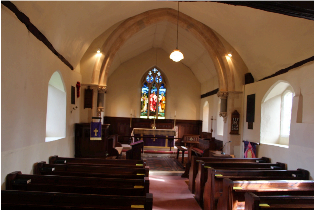
The nave and chancel at St James, Defford. The nave appears to be medieval - it has a moulded tie-beam roof (just visible in this shot).