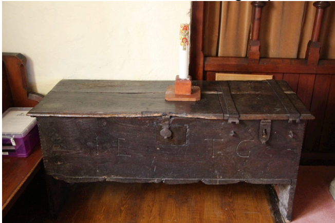
The steps to the church tower. Defford also has a three-lock parish chest, with what appears to be the initials of past churchwardens.