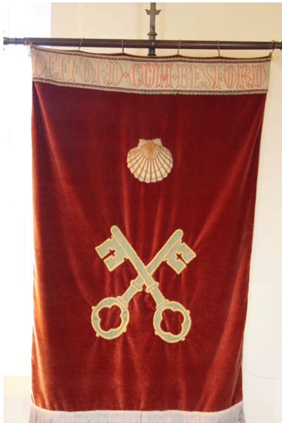
A church banner at St James Defford depicts the emblems of the patron saints of 'Defford cum Besford', St James's scallop shell and St Peter's keys of heaven.