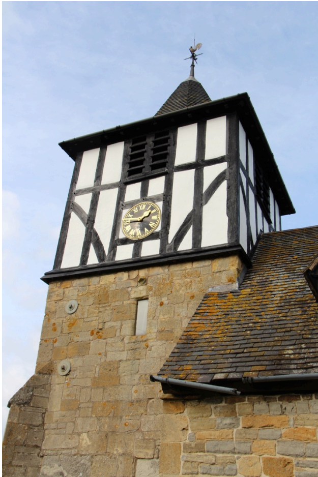
The upper part of the tower at St James, Defford, is timber-framed, renewed in the early part of the 20 th century but replacing an earlier timber tower. Some repairs to the guttering pending!