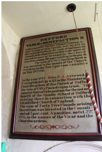
The vestry in the church tower contains 'alms boards', listing bequests of land and money to assist the poor, hanging on the wall.