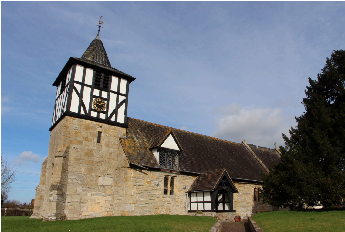
The church of St James, Defford.