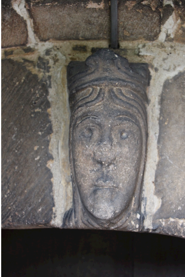
The keystone to the door at St James, Defford, carries the carved head of a queen of a type seen in the west portal of the cathedral at Chartres in Northern France and in the west portal at Rochester Cathedral in Kent. The style places it in the 12 th or early 13 th century.