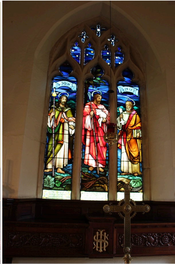
The sanctuary at St James, Defford. The window depicts St James and St Peter with Jesus.