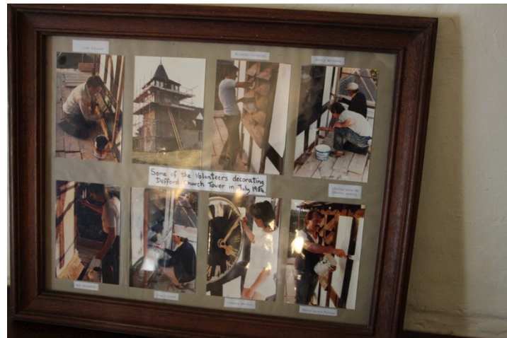
Photos of past vicars of Defford; also a photo record of the decoration of the tower by local community volunteers in 1984.