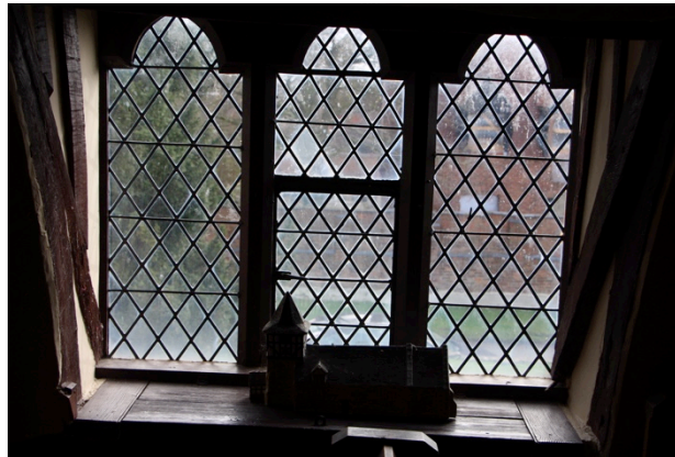
The windows in the south wall appear to be medieval.