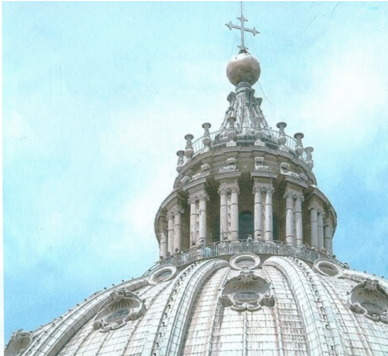
The golden ball at the top of St Peter's Basilica holds 16 people.