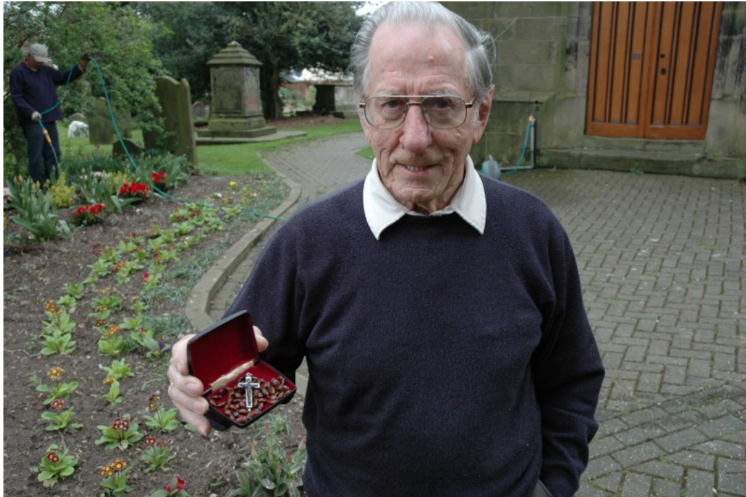
The Rosary blessed by the Pope in Rome, in 1945.