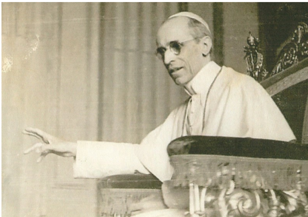
Pope Pius XII in 1945