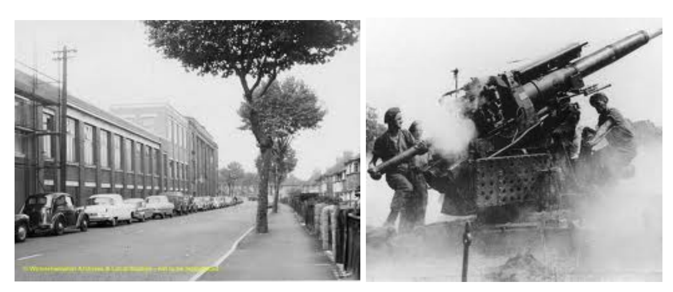
The Villiers factory in Wolverhampton where Alice made fuses for Ack Ack shells; and wartime anti-aircraft 'Ack-Ack' artillery in action in 1944.

When she was 16, war broke out and in Alice's words, "it upset everything". She was directed to shift work at Villiers in Marston Road Wolverhampton, to assist the war effort. The company employed female workers in many of its departments, as male employees were gradually called up to serve in the army. You worked on a rota of mornings one week, afternoons the next week, and nights the week after. She recalls: "It really upset your system!".