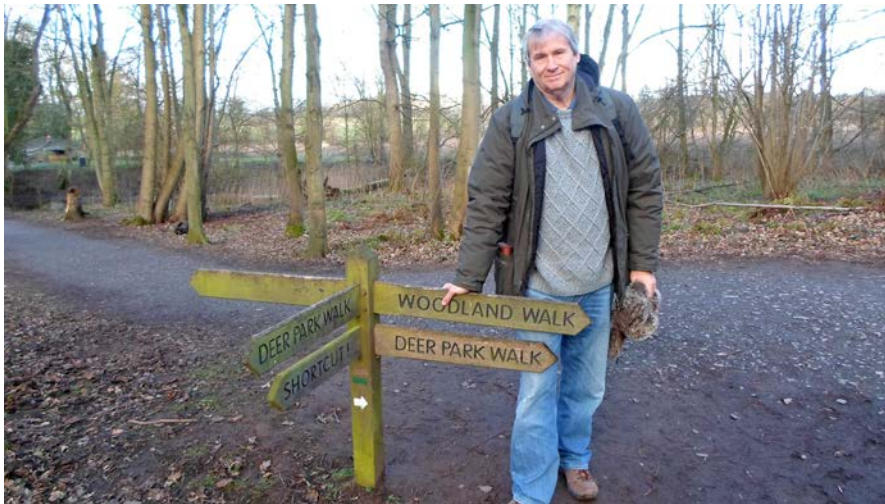
Signpost indicating paths through the woods.

We've visited Attingham Park , the regional HQ of the National Trust , many times, and it has the advantage of being one of the few local Trust properties that remain open over the winter.