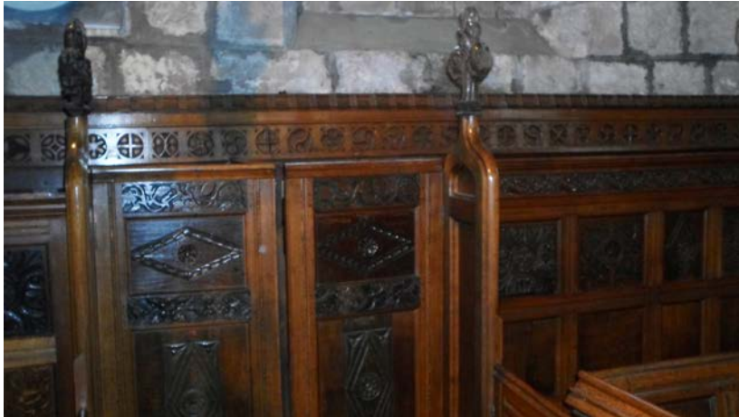
The choir stalls incorporate late medieval poppyheads and 17th-century reliefs.