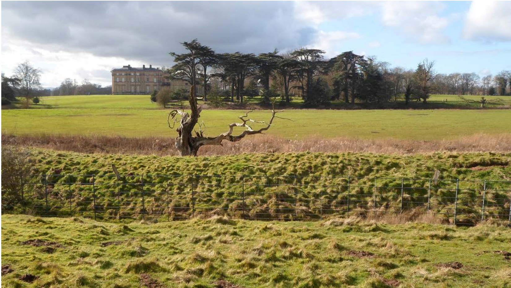
A distant view of Attingham Hall on the 'shortcut walk', February 2016