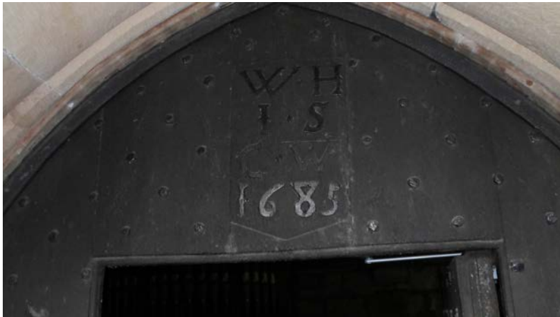
The inscription above the south door gives the date of construction as 1685.