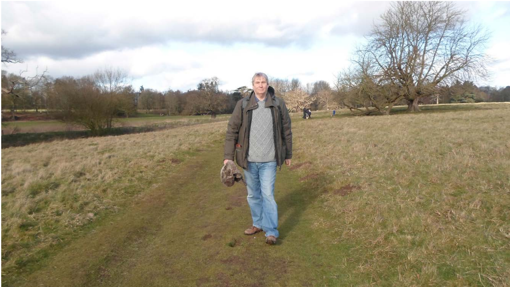
The 'shortcut' moorland walk at Attingham.