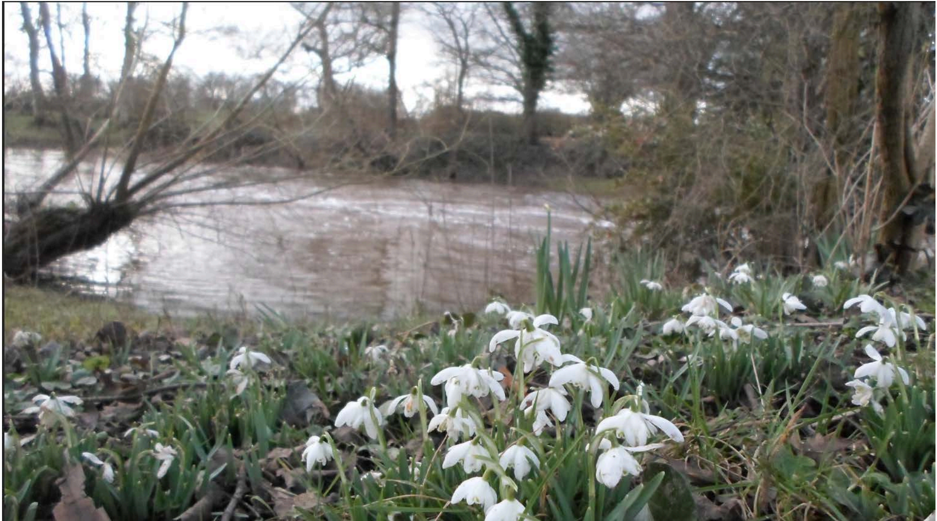
Snowdrops on the banks of the River Tern, by the weir at Attingham Park.