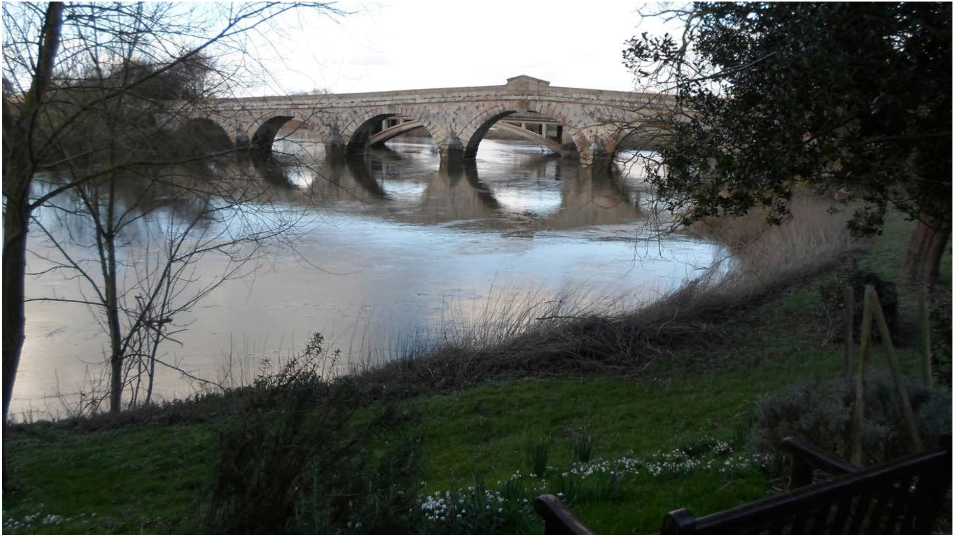
The bridge across the River Severn at Atcham.