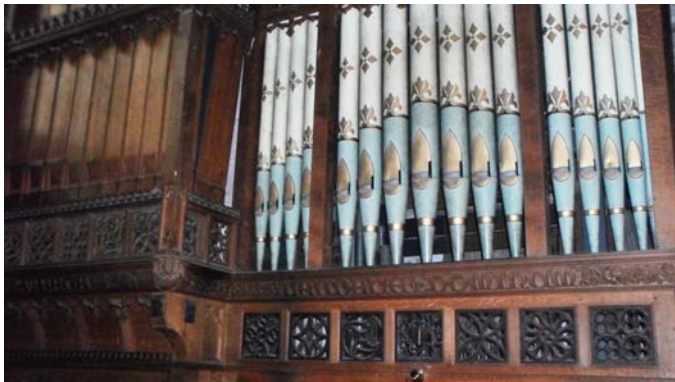
The organ was restored by Nicholsons of Worcester in 1897.