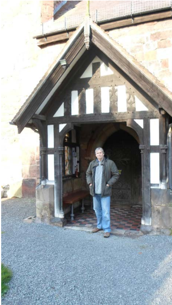
Entry to the church was through the south doorway.