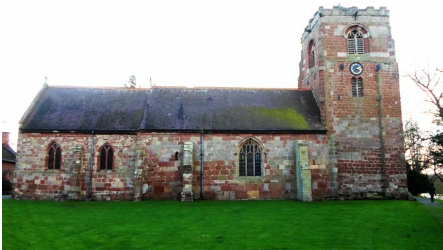
The side elevation of St Eata's, Shrewsbury.

Access to St Eata's is in fact directly opposite the entrance to Attingham Park, across the B 4380. The access road is shared with the Mytton and Mermaid pub.