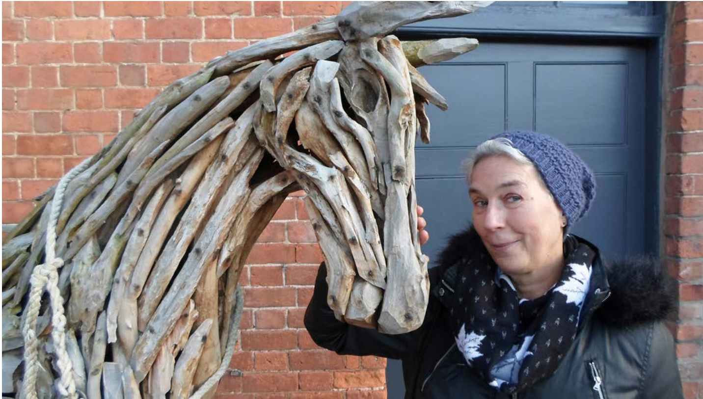
There are several life size sculptures of horses in the courtyard and in the stables at Attingham.