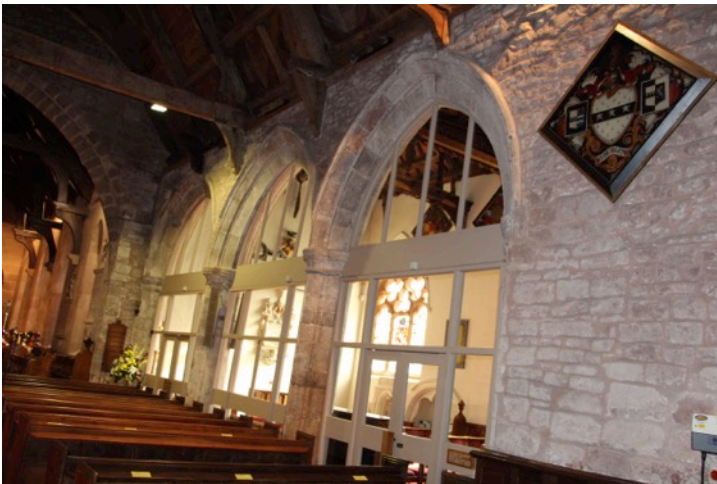
The Loton Chapel viewed from the Nave. It is named after Loton Park, the family seat of the Leighton family. During the Second World War bunkers beneath Loton Deer Park were used to store chemical and incendiary weapons, guarded by the US Army's Air Force.