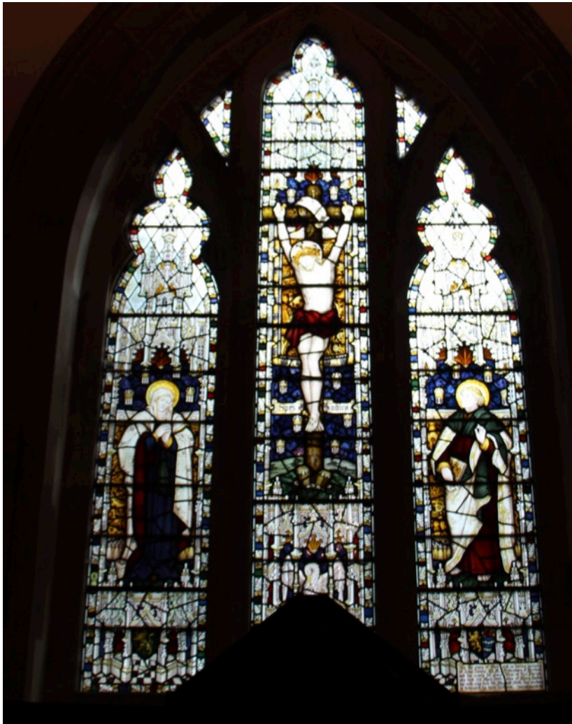
The Crucifixion depicted in the East Window at St Michael, Ford.