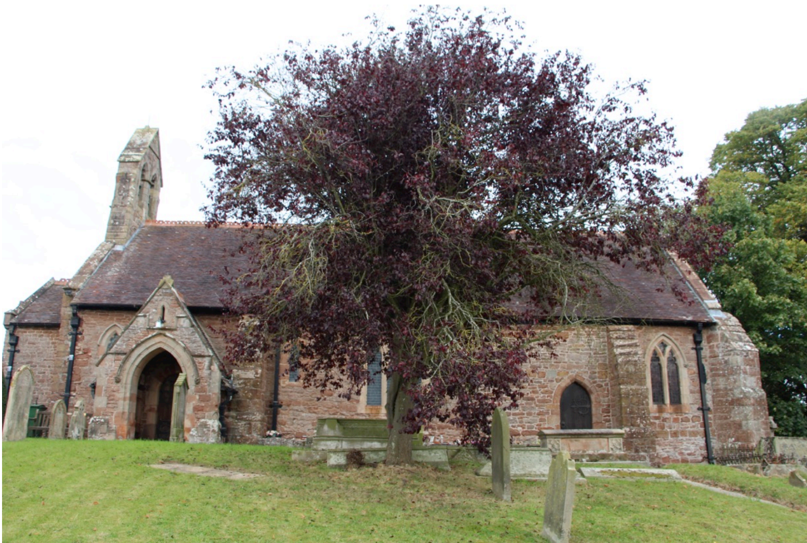
The 12 th century church of St Michael at Ford sits at the top of a hill.