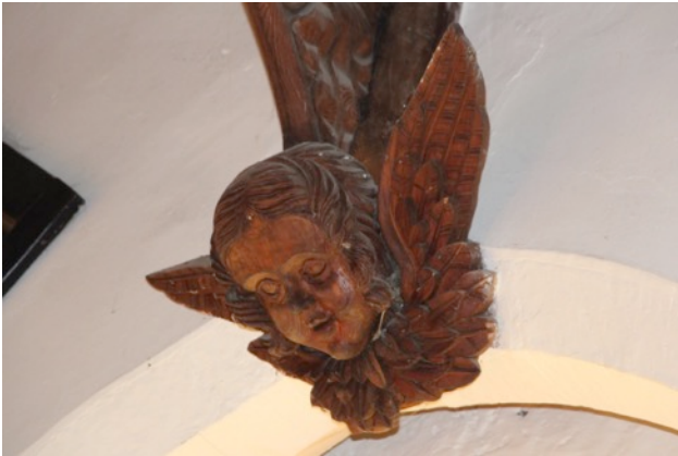
A carved angel looks down from the roof in the Loton Chapel.