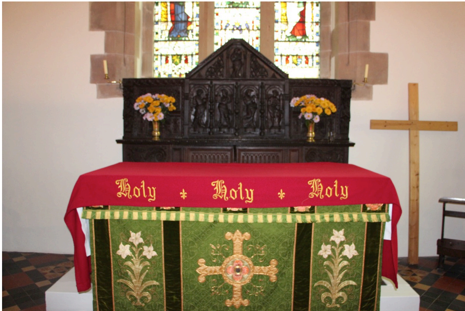
The beautiful altar and reredos at St Michael, Ford.