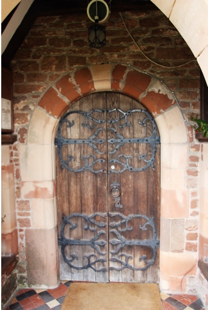
The beautiful oak entrance door at St Michael, Ford.