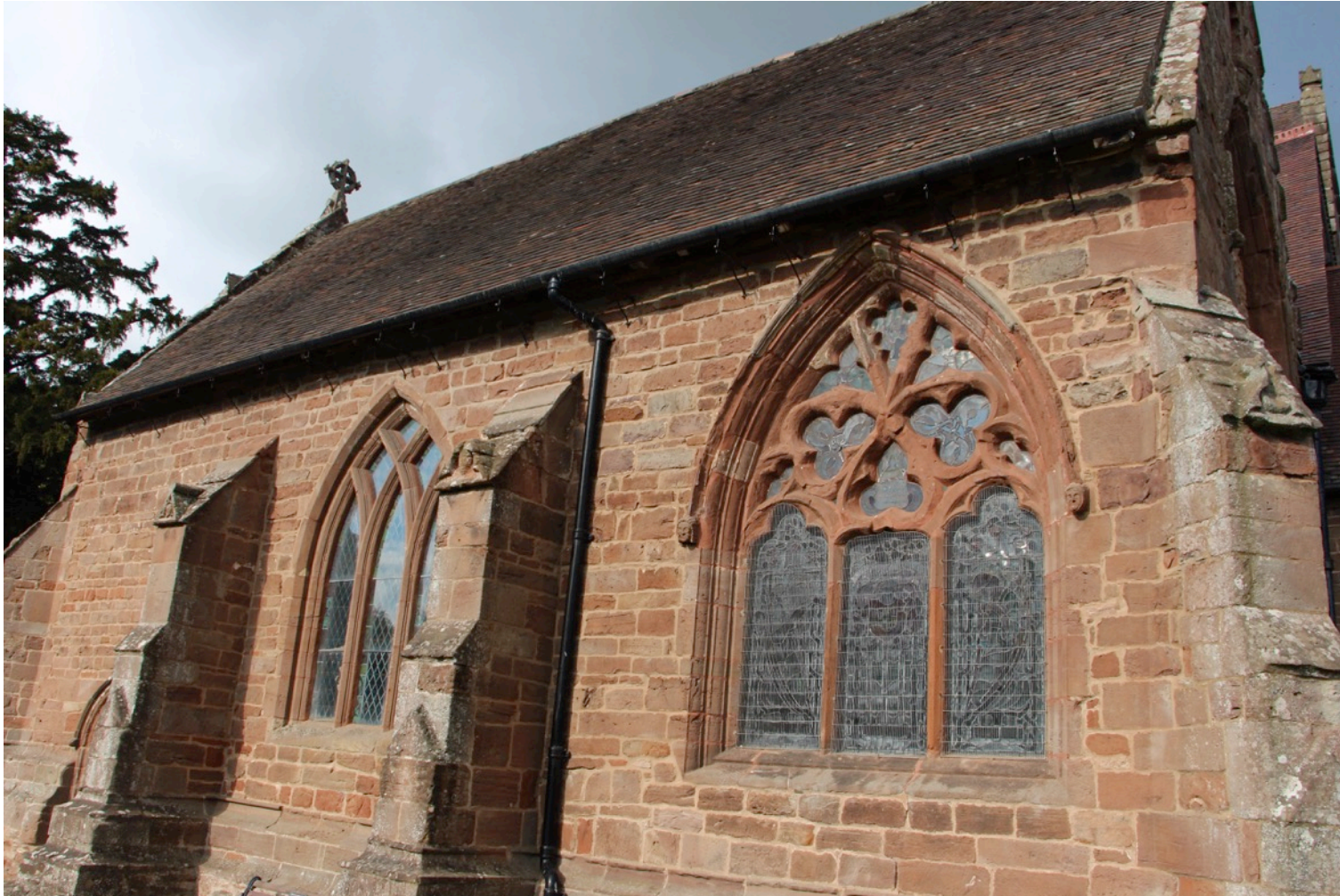
The chancel at St Michael and All Angels – external view.