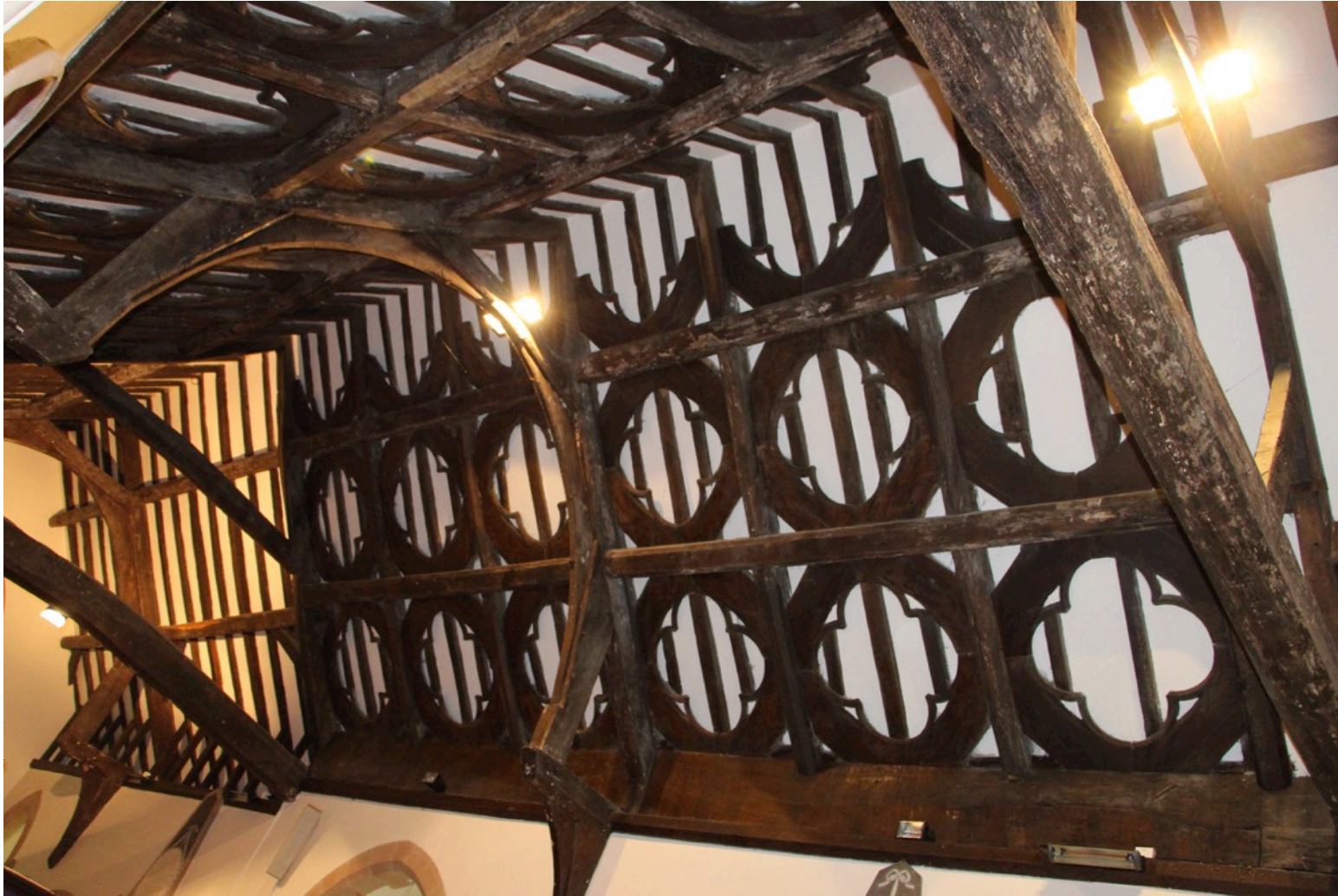
The glorious hammer beam roof at St Michael's, Ford.