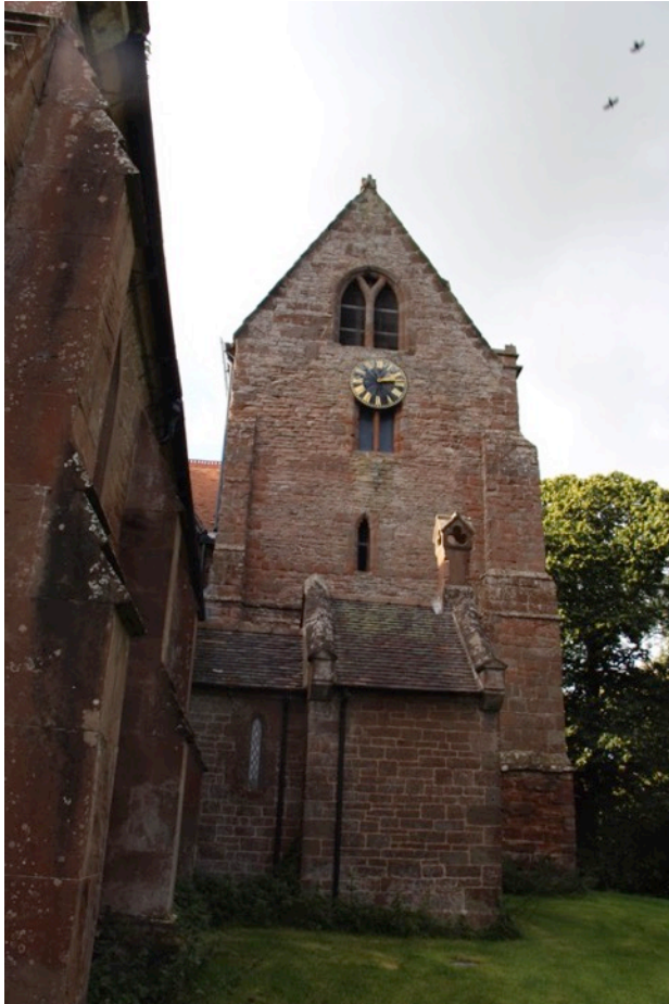
An unusual 'saddleback' tower at St Michael and All Angels Alberbury built around 1200. It has the appearance of a defensive structure – the area was subject to incursions from Wales and may have been built partly as a place of refuge in troubled times. There are a number of such buildings mainly near the Welsh border.