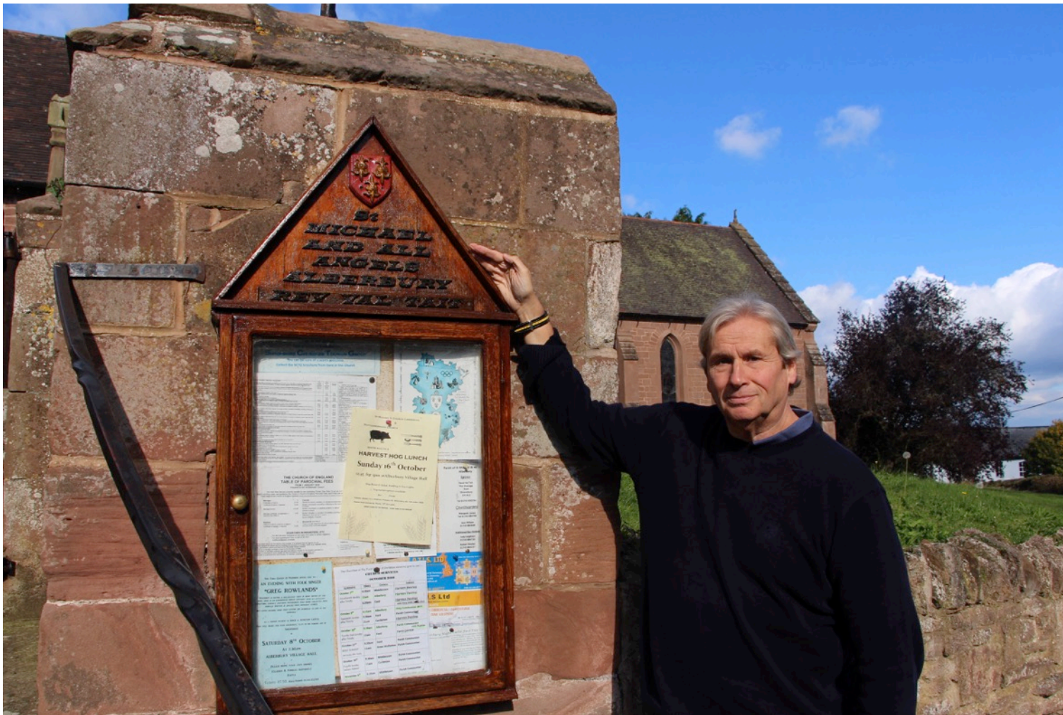
The beautiful carved noticeboard at Alberbury.