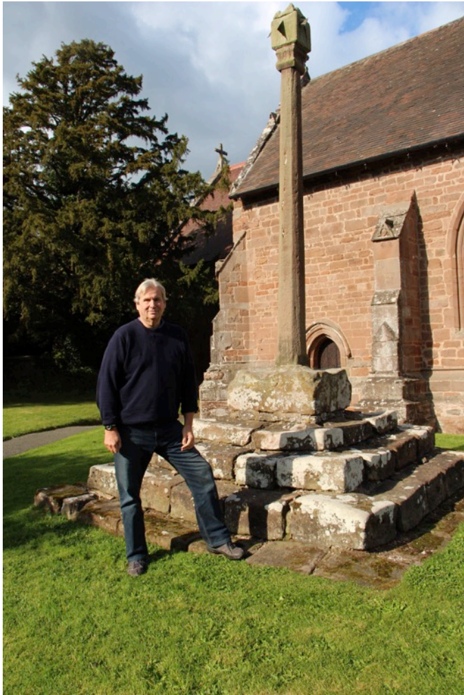
A medieval stepped churchyard cross, with a sundial at the head probably added in the 17 th century.