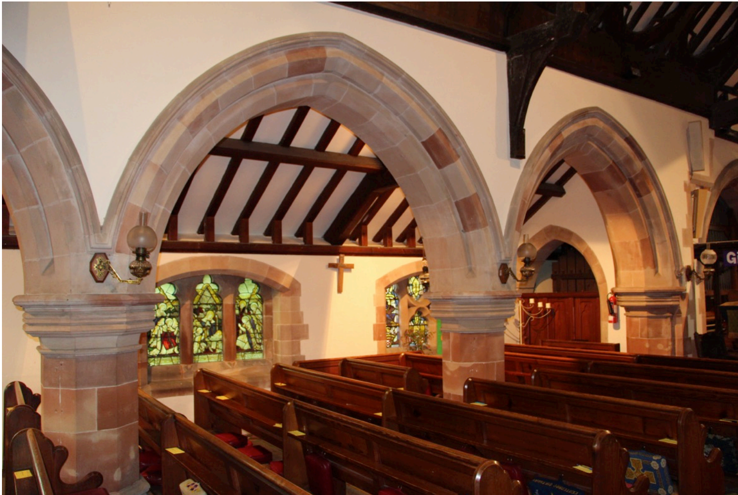
The nave and arches at St Michael, Ford.