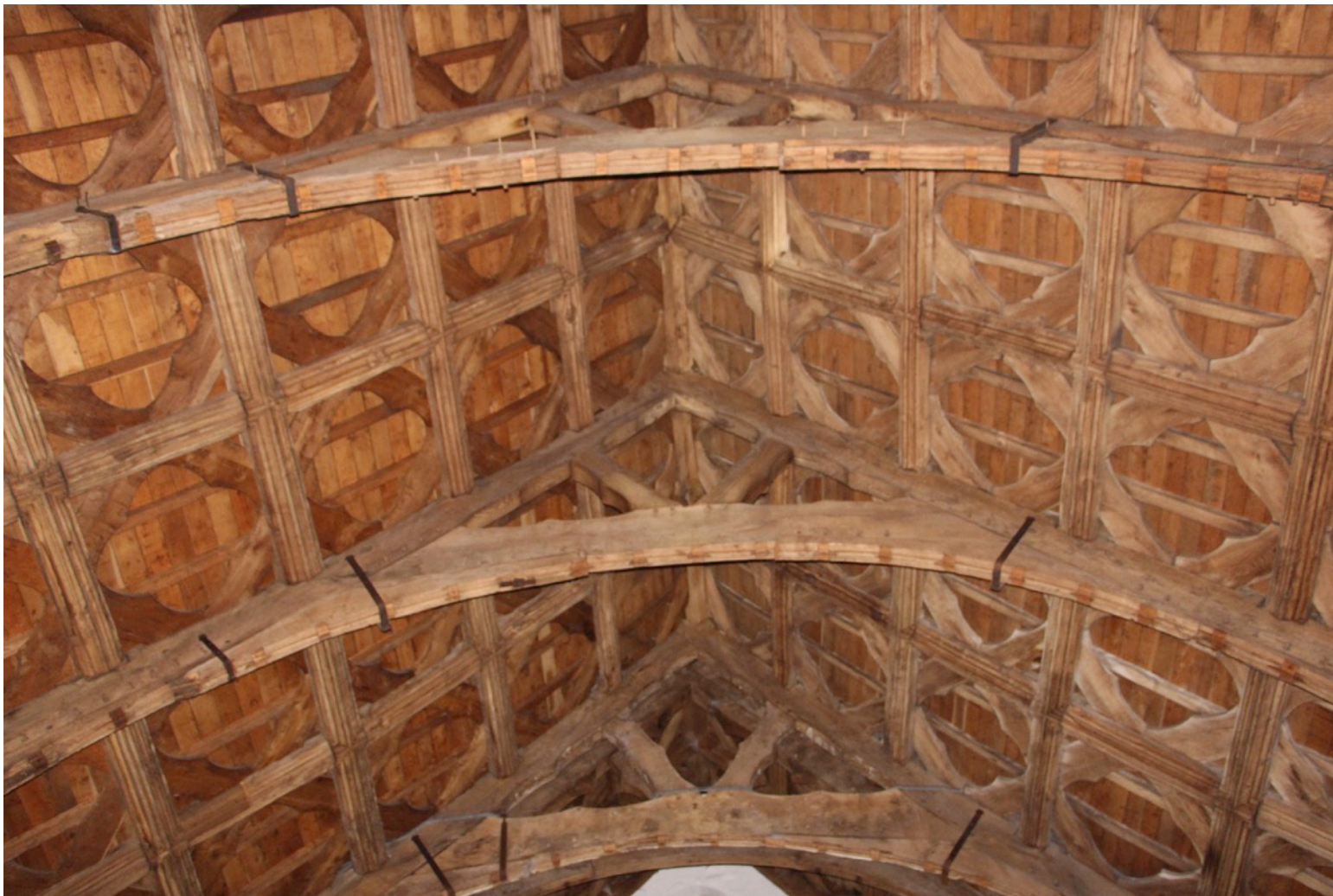
The roof of the nave, 15 th century: 'Arch braced collar beam form with short hammer beams and cusped windbraces forming five rows of quatrefoils to each slope, with four moulded purlins'.