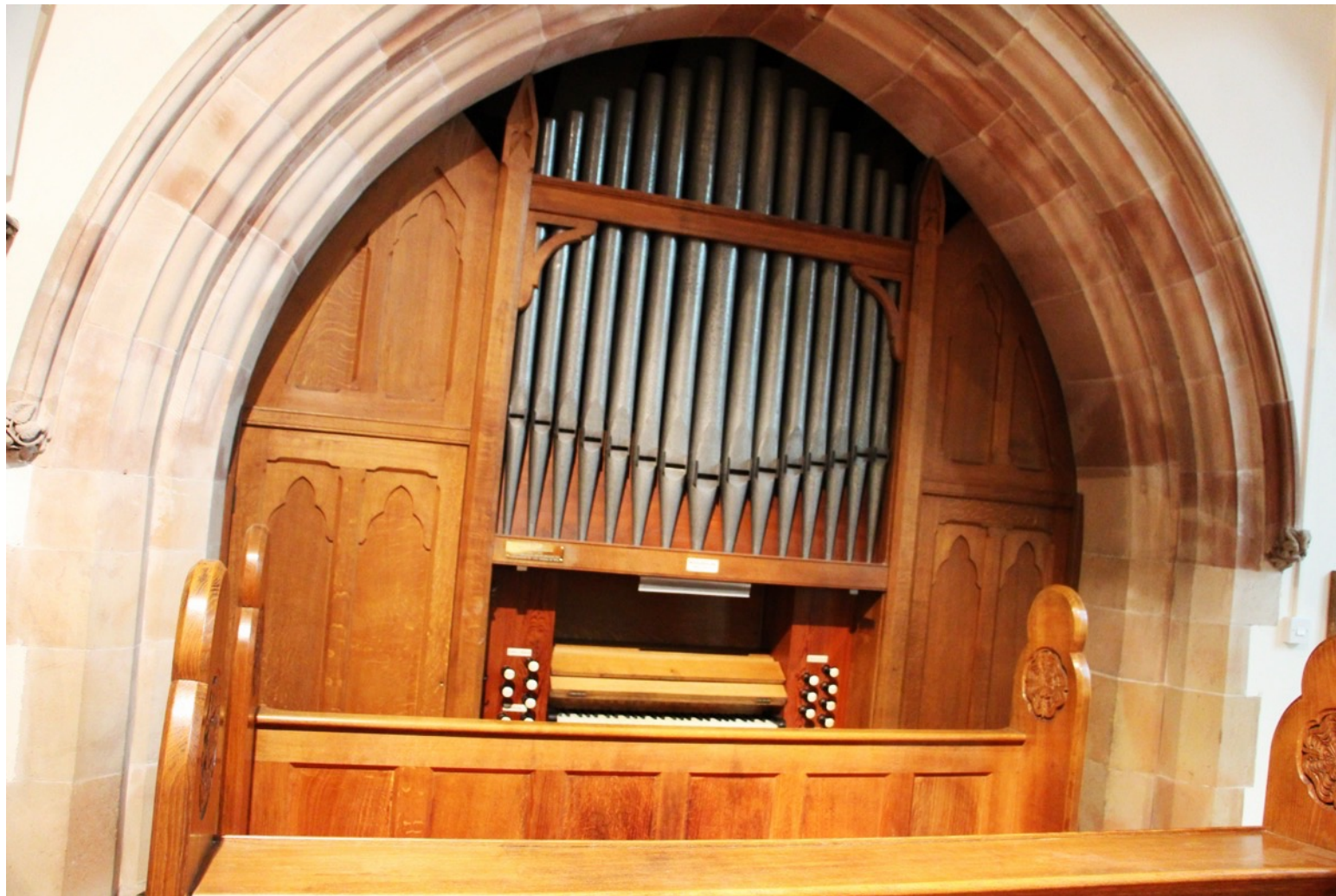
The organ at St Michael, Ford.