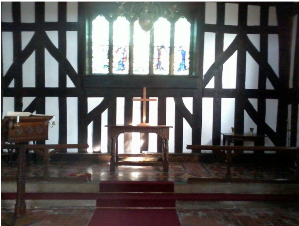
The altar at Molverley

The church of timber, wattle and daub construction is mentioned in a document of 1141, but in 1401 the church was burnt to the ground by Owain Glyndwr and rebuilt in 1406 - rather optimistically once again using wood! The entire structure, of Molverley oak, is pegged together, with not one nail being used.