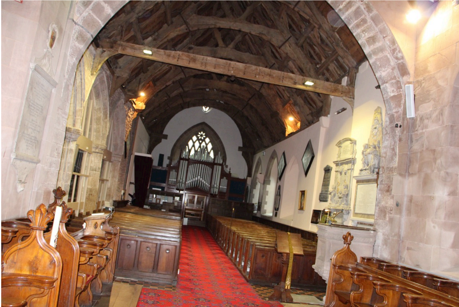
The superb nave and organ at St Michael Alberbury, from the Choir.