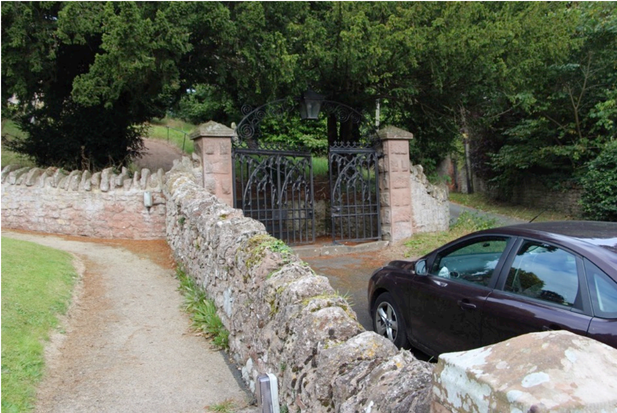
The approach to St Michael, Ford. The church is in a secluded location on a hill, set behind impressive iron gates.

St Michael's Church, Ford is situated in a tranquil conservation area just west of Shrewsbury. The building dates back to the early 12 th century and boasts many interesting features. The restoration in 1875 added some fine glass, in particular the East Window depicting the Crucifixion. There is a splendid hammer beam roof, possibly 15 th century. The 'Humphrey Kynaston Walking Route 5' passes by the church.