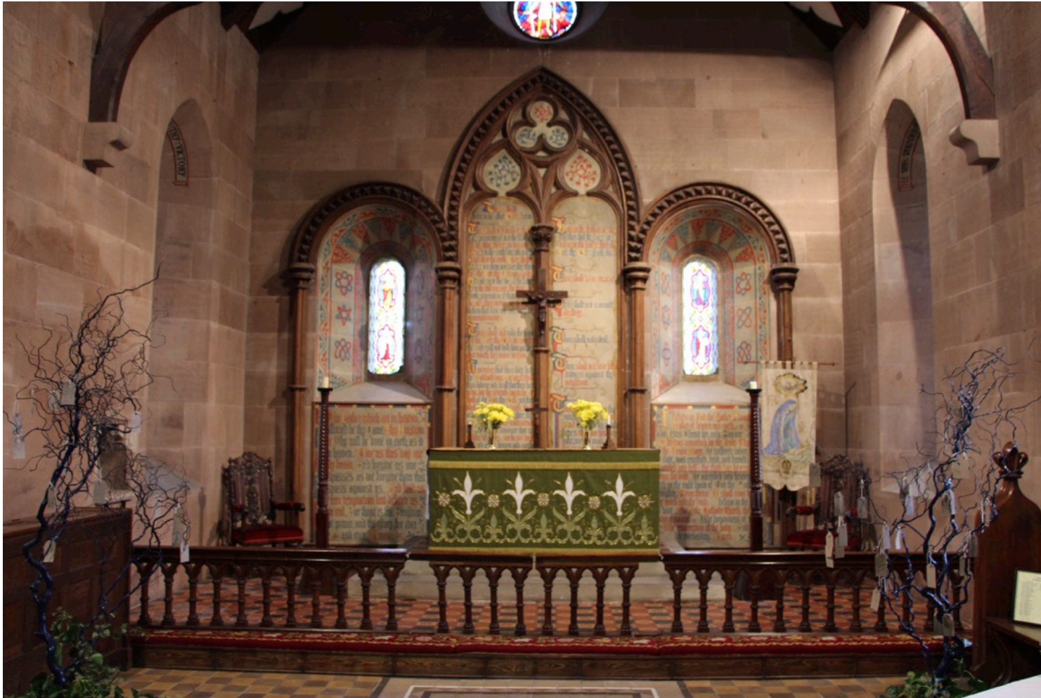
The beautiful chancel at St Michael's Alberbury – the back wall is covered with The Lord's Prayer, the Ten Commandments and the Apostles' Creed painted as wall murals.