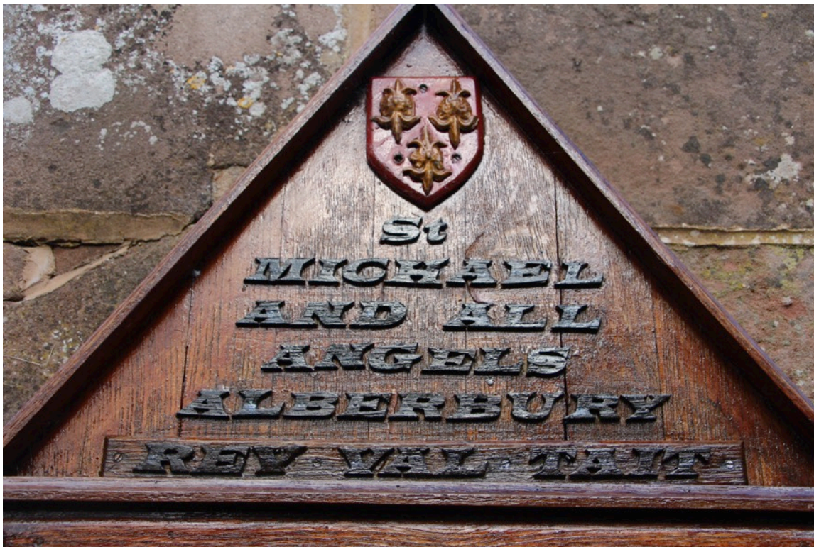
The carved wooden noticeboard at St Michael and All Angels, Alberbury.

The nave is described as the 'finest example of a late medieval roof in all Shropshire' by Nikolaus Pevsner. It has an impressive saddleback tower built around 1200. The Loton Chapel was added in 1320 and contains a Burne Jones Pre Raphaelite window.