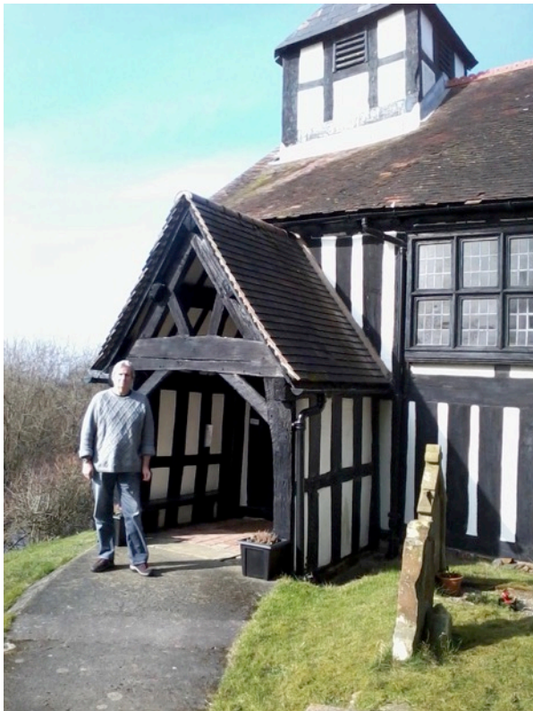
The black and white church at Melferley.

We conclude this article with a church from our first visit to the area in March 2016 – a wooden construction high above the River Severn at the confluence with the River Vyrnwy , on the Welsh border.