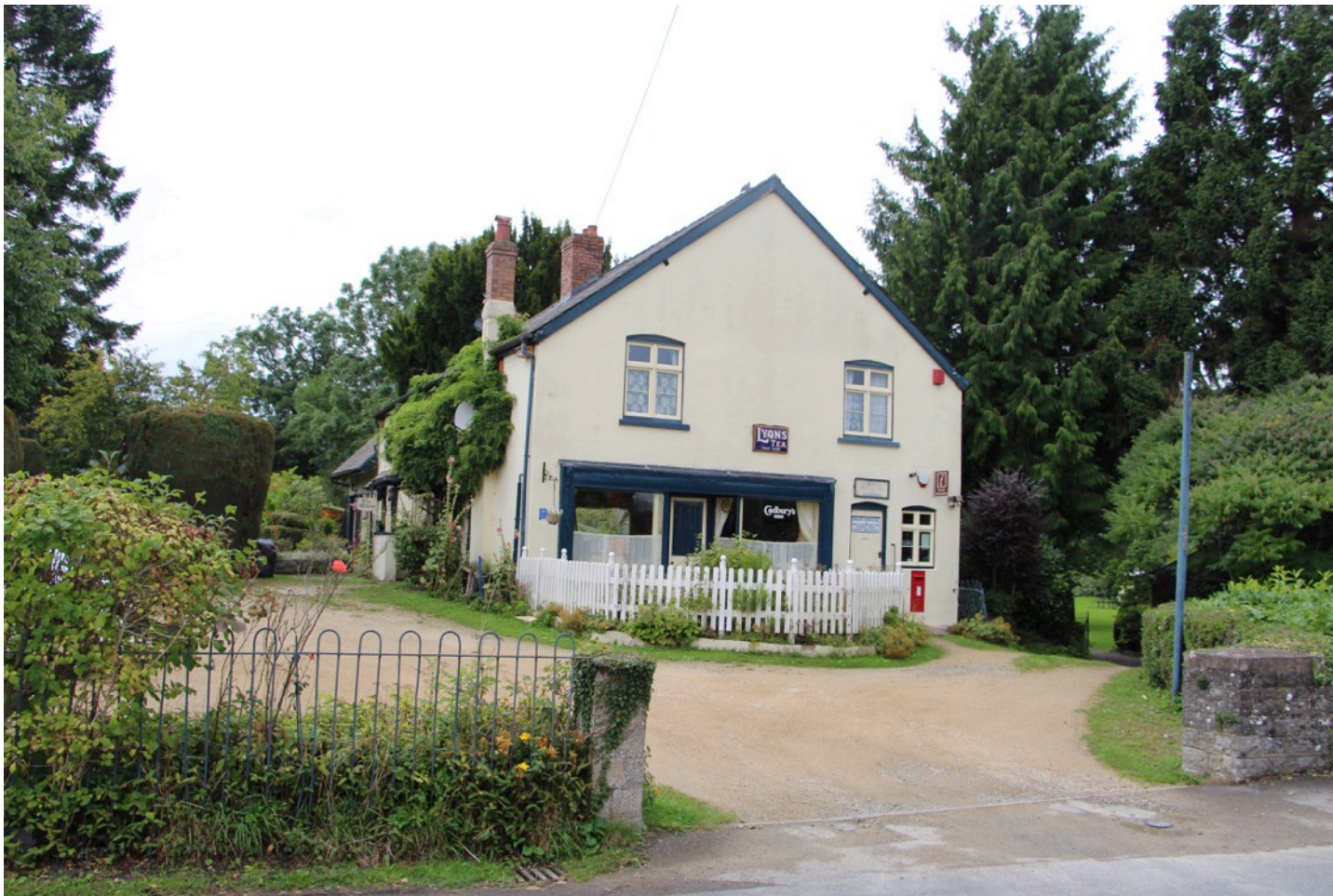
In the centre of Bucknell village near the church is a tea shop and tourist information centre.