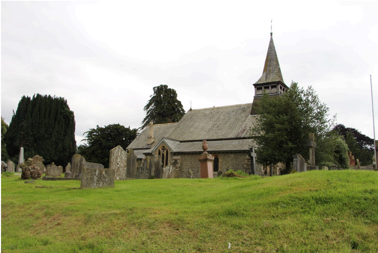
St Mary's Church and churchyard, Bucknell, Shropshire.