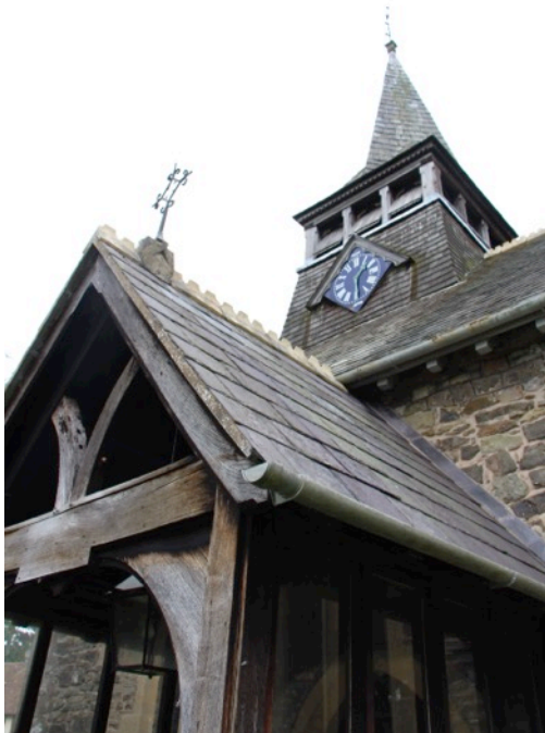
The wooden porch; and tower which contains a clock and three bells.

Although in Shropshire, St Mary's Bucknell is in the Diocese of Hereford. The nearest towns are Clun in Shropshire and Kington in Herefordshire – it's very close to the border with Radnorshire in Wales. The church is believed to have been constructed in 1140, and rebuilt in the 14 th century. It's one of seven churches in the Middle Marches Benefice. In the Domesday Book the village was referred to as 'Buckehale'. The area was held for the Crown by Roger de Montgomery, but tenanted by Ralph de Mortimer who held Bucknell. William de Picot of Clun Castle was a nearby tenant.