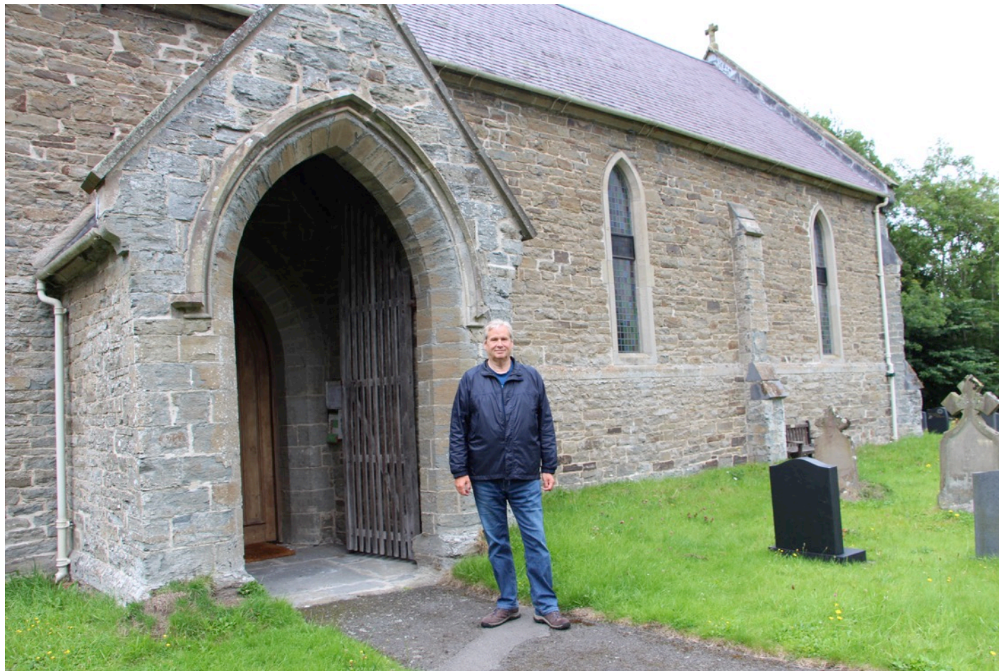
St Mary's Church at Chapel Lawn was, alas, locked when we visited.

After our visit to Bucknell, we drove on to investigate another church in the benefice – St Mary’s Chapel Lawn.