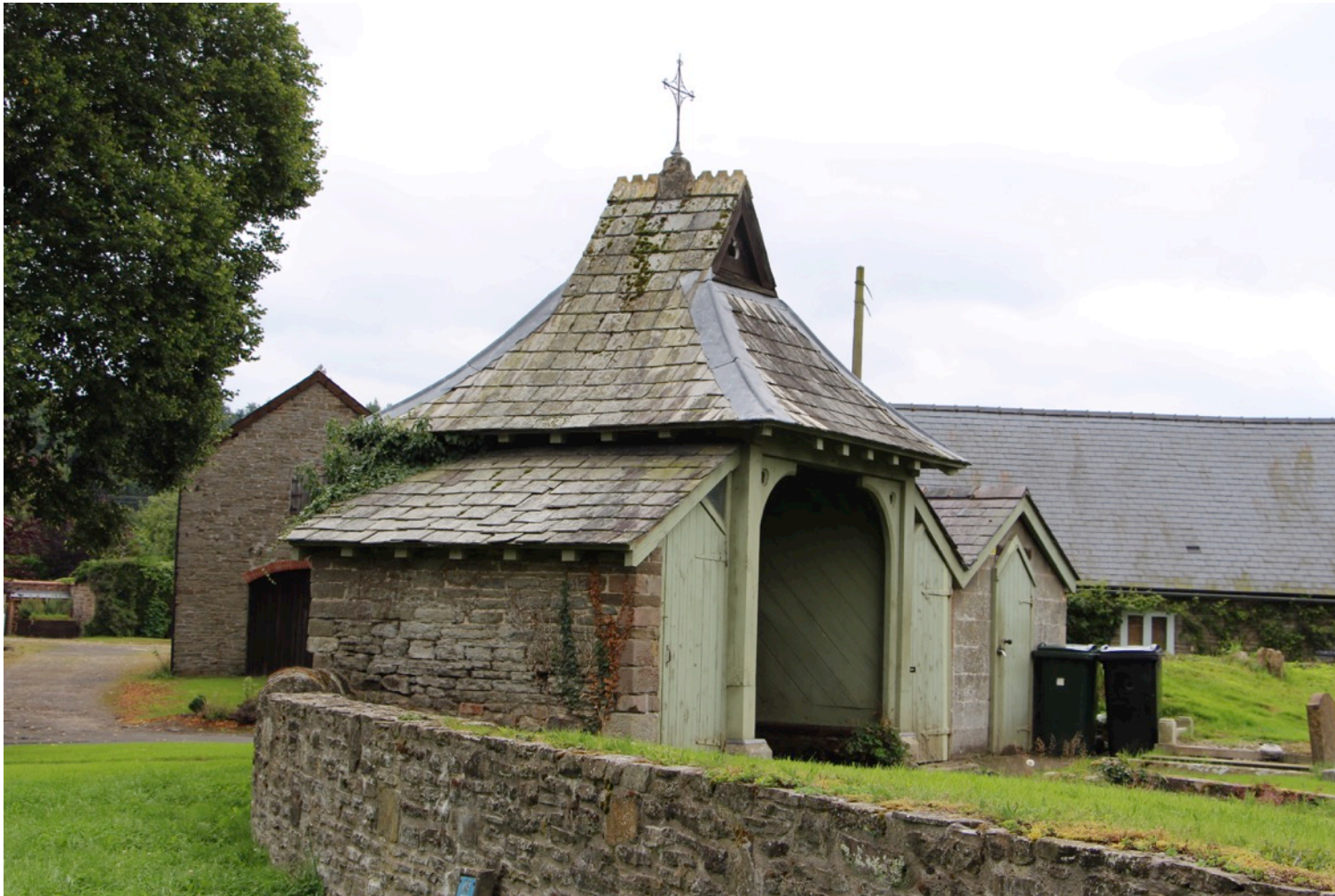
An unusual lych gate at St Mary's Bucknell, with storerooms either side of the gateway.