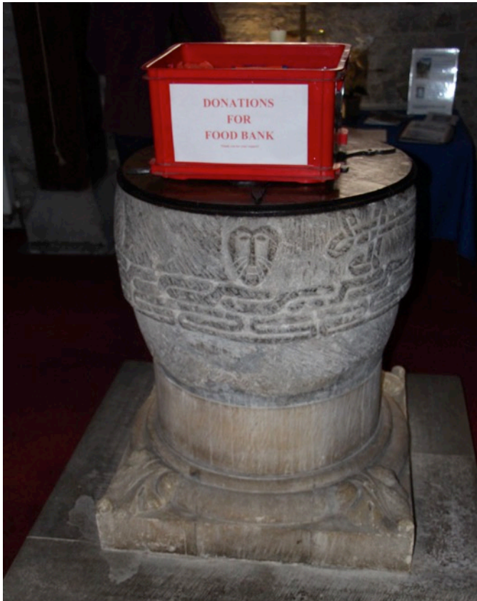
The font at St Mary's Bucknell; the interlaced design is Norman and the face is Saxon. The base is more recent. The face in the centre of the font depicts a lion or cat.