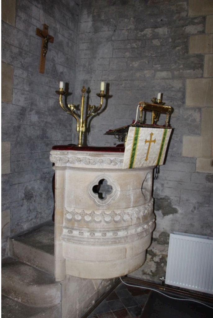
The pulpit at St Mary's Bucknell.