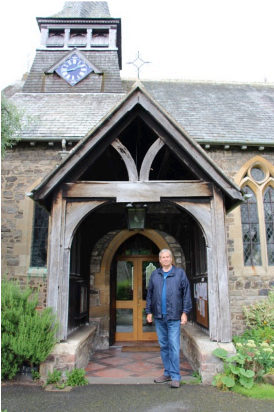
The Parish Church of St Mary's, Bucknell, in Shropshire.