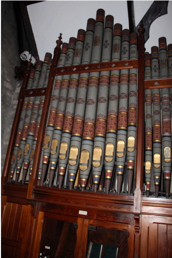
The organ dates from 1880. It was made by Conacher and Co of Huddersfield.