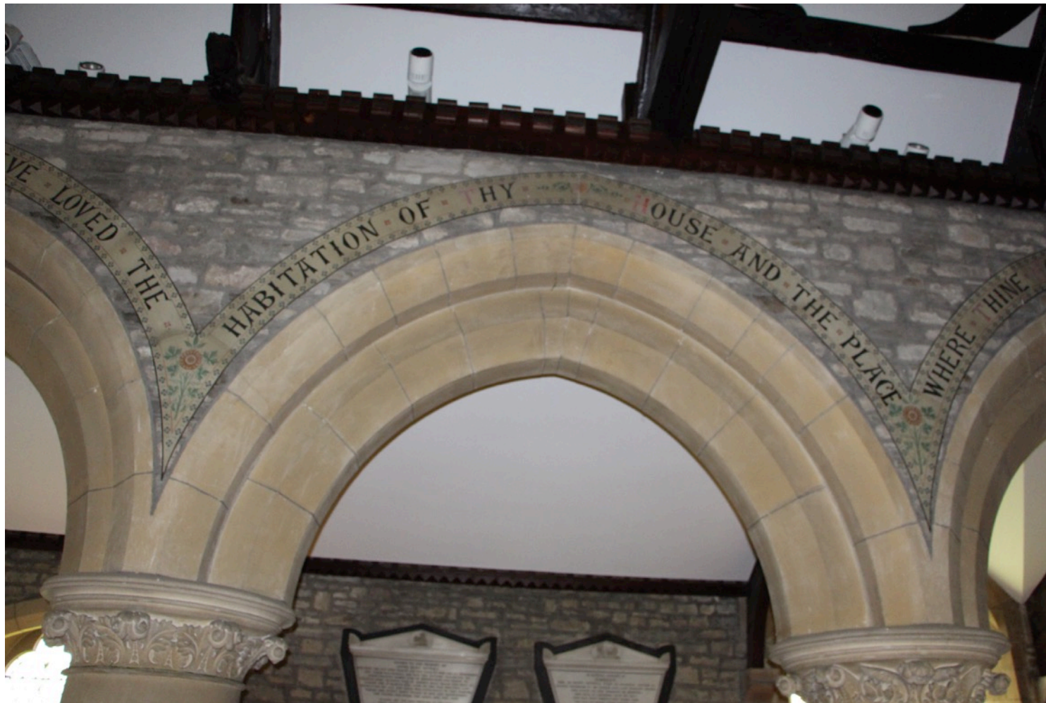
Three arches in the nave bear the painted inscription: 'Lord I have loved the habitation of thy house and the place where thine honour dwelleth'.