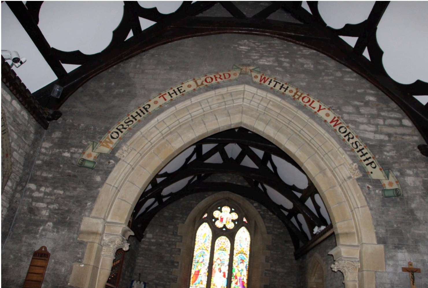
The chancel arch bears the painted inscription: 'Worship the Lord with Holy Worship'.