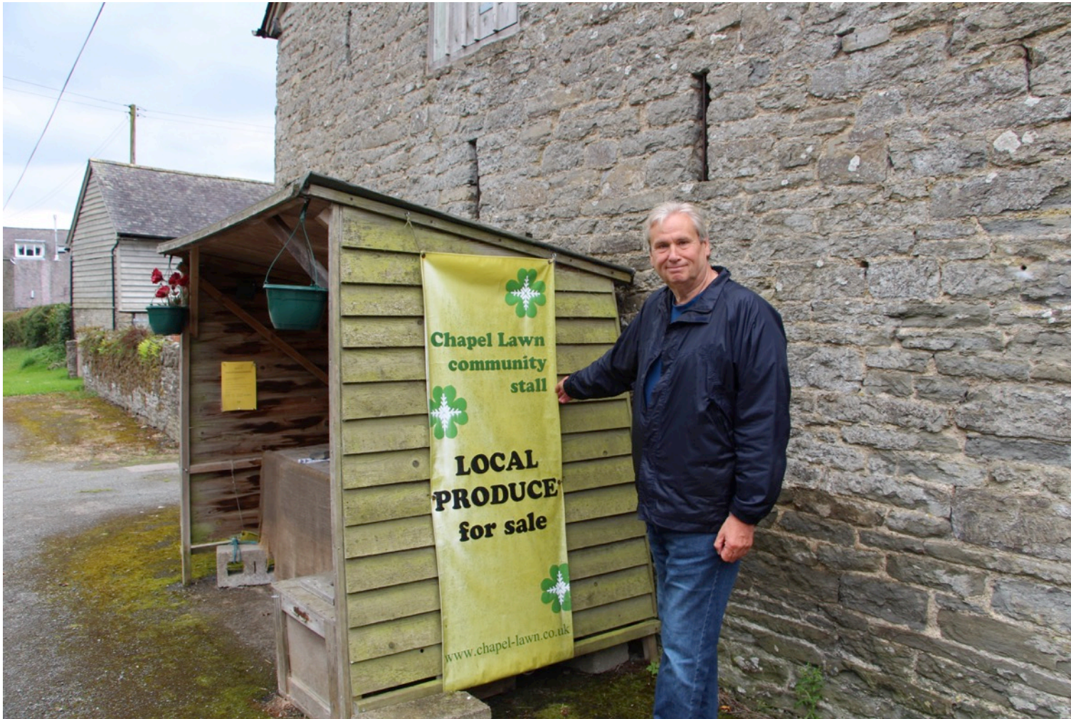
Chapel Lawn had an honesty stall where local people could sell produce.