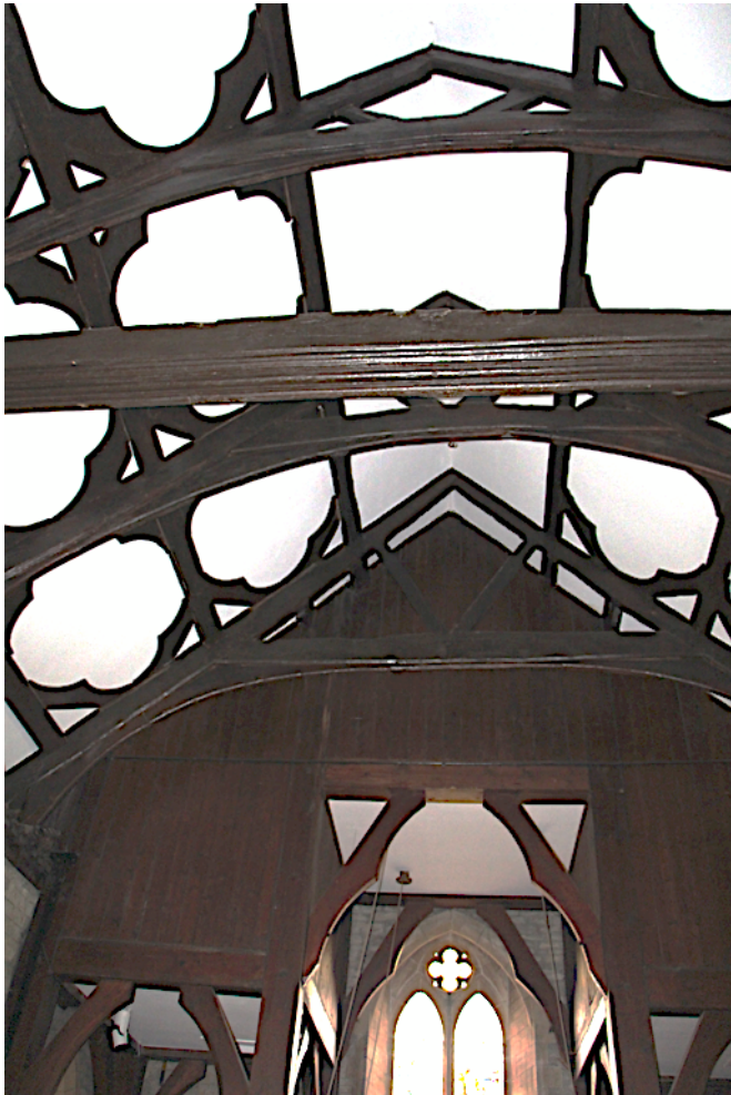
The roof of the nave at St Mary's Bucknell. The nave roof has five trusses (wooden frames) - the central one has tie and collar beams.