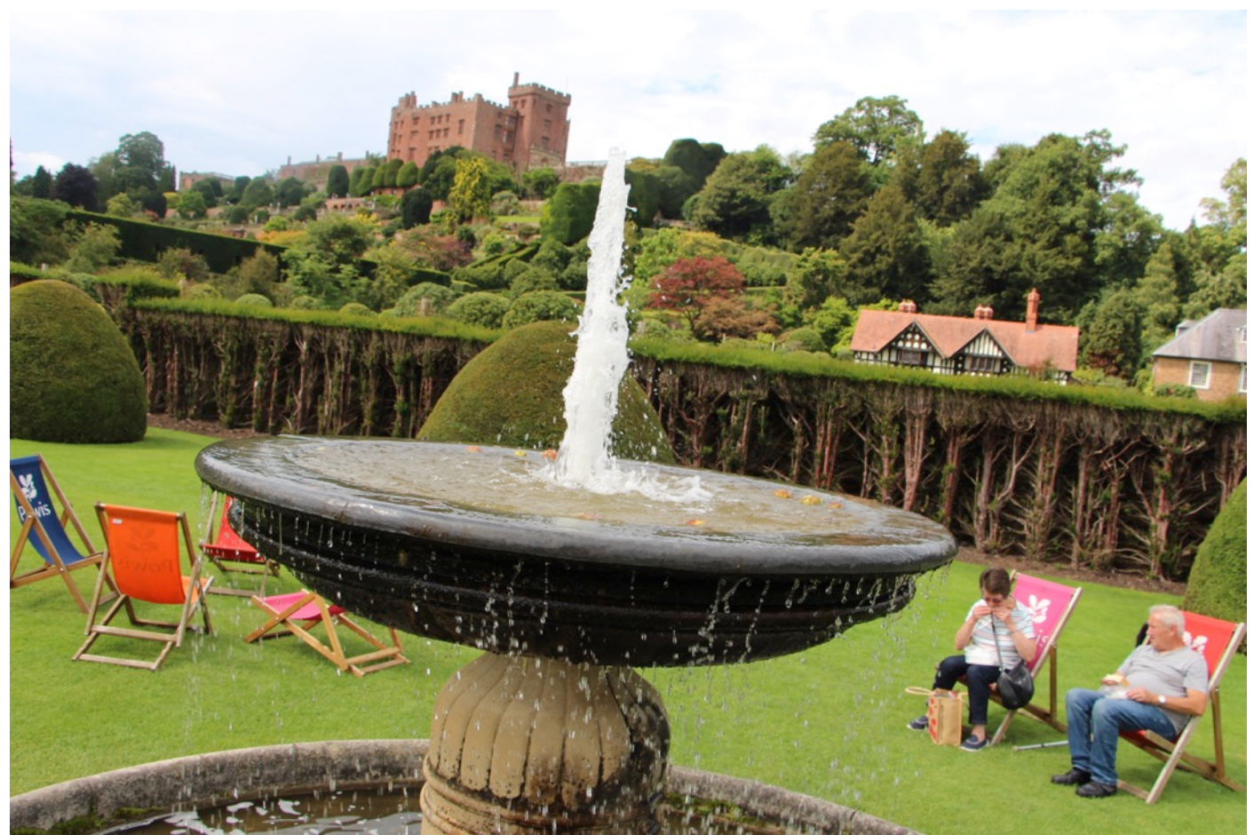
The lower level of the castle has a beautiful fountain, what remains of an extensive 17<sup>th</sup> century Dutch water garden. 'National Trust' deck chairs are laid out in groups for the convenience of visitors in the summer months.