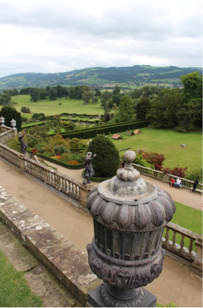
A view of the Powys countryside from the Italian Renaissance-influenced flower terraces containing statues. When we visited, the grassed area in the distance was being used for children's activities.