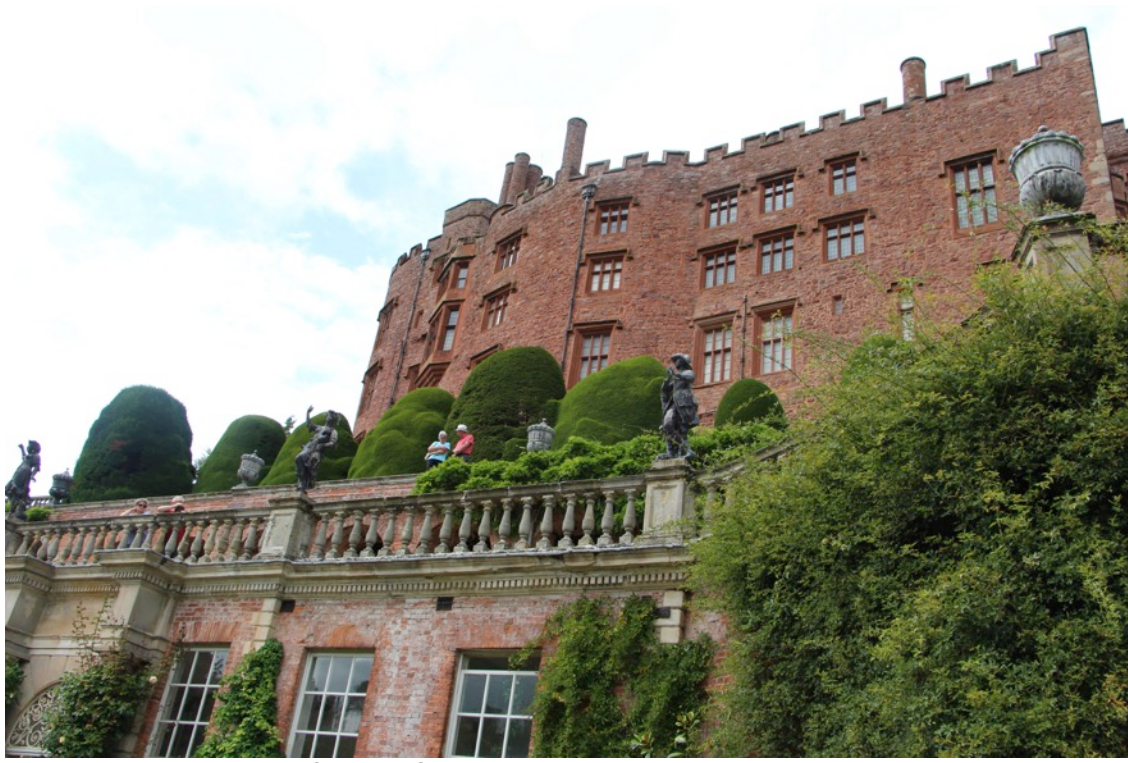
The Italianate terraces of Powis Castle.

Following the end of the Welsh Wars (1282) and for his loyalty to Edward I, the King permitted a Welsh prince, Gruffydd ap Gwenwynwyn to begin building Powis Castle circa 1283.